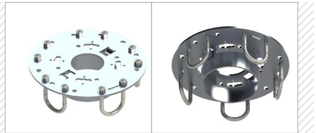
FUA002 FOR TAPERED HANDWHEELS (30° TO 40°)