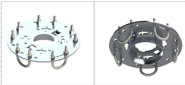
FUA001 FOR FLAT OR SLIGHTLY TAPERED HANDWHEELS (<30°)

These drive plate adaptors can be used directly on a banjo head . To use them with a straight or right angle head , you need to use the KPA004 interface (see technical sheet 11). They can also be used with extension bars using the interface TTA (see technical sheet 12).