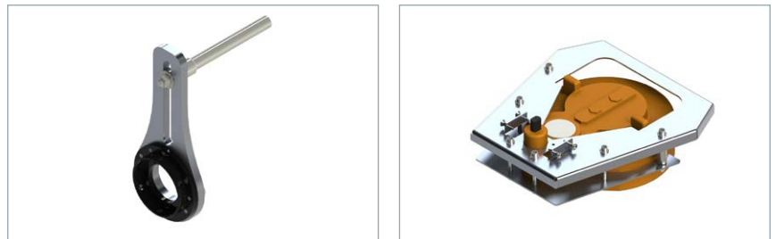
Reference – made to order

These flanges are made to order by our technical department based on the specific characteristics of your system.